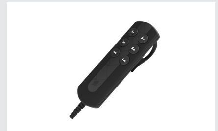
Hand set cable