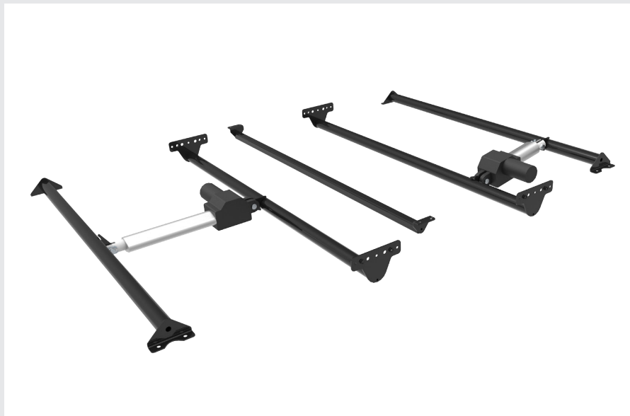
Adjustment of head- and foot section by means of linear motors AxosDrive